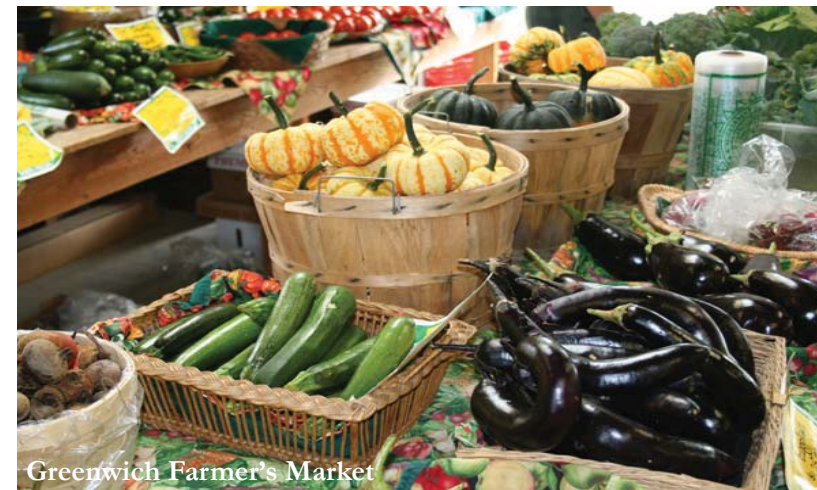
Greenwich Farmer's Market

The Village of Greenwich, situated on the Battenkill, is a rural waterfront community that appreciates, stewards, and sustains its many resources. The Battenkill, a nationally recognized trout stream, provides a dramatic backdrop for the village which has been called “the most extraordinary, beautiful and architecturally intact village in all of upstate New York”. It’s vibrant, walkable district is host to the Whipple City Festival and Greenwich Downtown Harvest Festival, and is at the heart of a diverse economy that supports a niche of early American art and furniture. Nineteenth-century storefronts line Main Street and provide distinctive dining and shopping in a historic small town environment.