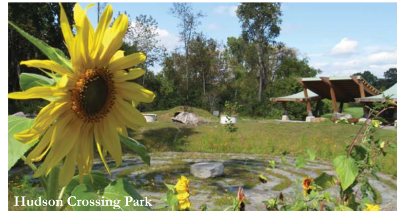
Hudson Crossing Park

The Town seeks to improve the economic condition of the community by supporting the enhancement of a network of related recreational, historical, and environmental experiences. Two outstanding intermunicipal projects were identified in the Joint Open Space and Recreation Plan, a collaborative effort with the Town of Saratoga. Schuyler Park, a community grassroots project, is designed primarily for active field sports but also offers a trail system. Hudson Crossing Park, centered around the Lock 5 Island, is a favorite destination for both residents and visitors.