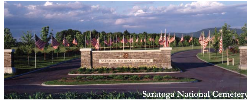
Saratoga National Cemetery

The Town of Saratoga prepared an Open Space and Recreation Plan jointly with the Town of Northumberland in 2007 to prepare for future land use decisions. The plan sets priorities for preserving special places and promotes priority projects such as the completion of segments of the Champlain Canal Trail and the construction of a waterfront park and boat launch on the Hudson River.