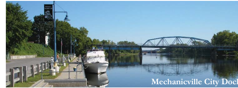
Mechanicville City Dock

Mechanicville, with its nearly two miles of Hudson River waterfront, has been an important crossroads since Colonial times. Like many communities in the northeast United States, Mechanicville was affected greatly by the 19th century Industrial Revolution. Located just north of Albany, the city was a key point on the Erie Canal and Champlain Canal systems and a major hub for railroads and other industries. The latter half of the 1800s and the early 1900s brought a succession of various immigrant groups, and the city's rich character, to this day, is a reflection of these colorful Americans.