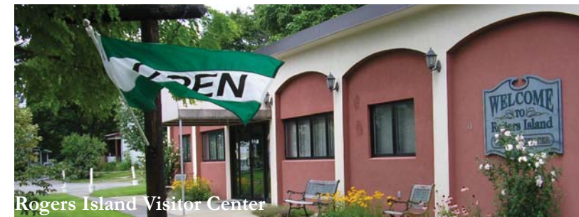
Rogers Island Visitor Center