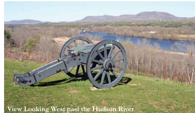
View Looking West past the Hudson River

The Town also continues to work with regional partners bringing to fruition the ideals of the Stewardship Plan and many others. Projects indentified in the comprehensive plan are one of many ways the Town hopes to help bring regional projects to reality.