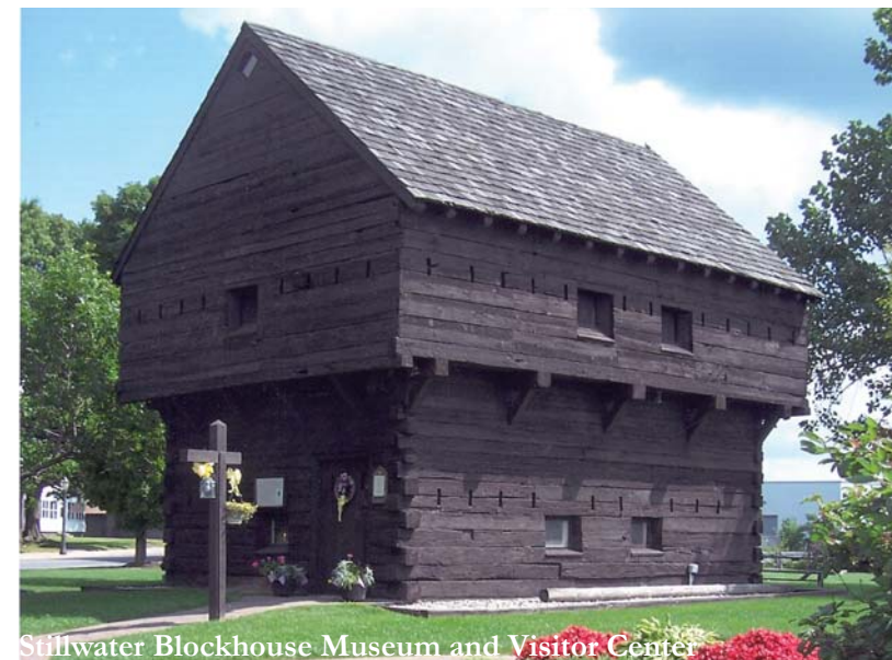
Stillwater Blockhouse Museum and Visitor Center