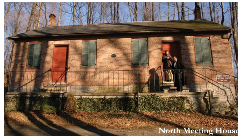
North Meeting House

The Town of Easton is one of the most beautiful agricultural communities in the Hudson River Valley. From the mountains on the east, to the Hudson River on the west, the landscape is enhanced by the patchwork of open fields and wooded areas. The numerous streams, including the BattenKill, support the Town's diverse wildlife and wild-flowers, and provide water supply for other communities. The rolling hills and river valley offer a diverse landscape for a variety of more than 30 agricultural businesses – dairy, beef, horses, sheep, vegetables, fruits, field crops, plus small scale ventures such as apiaries, vineyards, emus, goats, and poultry. There are also agricultural products stores, a veterinary clinic for small and large animals including bovine, a farm machinery business, an organic dairy, and two organic farms serving the region as Community Supported Agricultural (CSA) operations. Residents and visitors enjoy locally grown produce available at the many farm stands, homemade ice cream, and world-famous melons. The Washington County Fair, one of the largest agricultural fairs in NYS and now celebrating its 50th year at the Easton location, has year-round activities including auctions, and education and regional events. Easton also has two golf courses overlooking the BattenKill Corridor, and picturesque views which can be enjoyed while hiking at trails at the Dionondehowa Falls, and at the Willard Mountain Ski Area where many winter sports events are held.